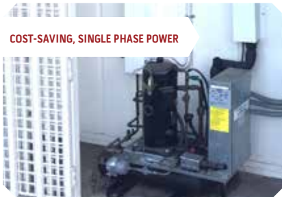
COST-SAVING, SINGLE PHASE POWER

30' REFRIGERATED CONTAINER | 2,391 CUFT.