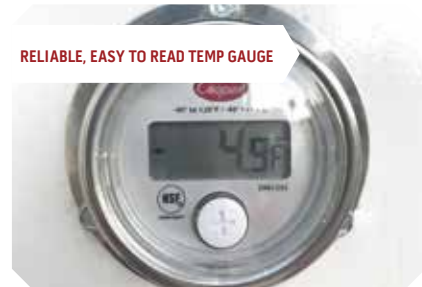
RELIABLE, EASY TO READ TEMP GAUGE